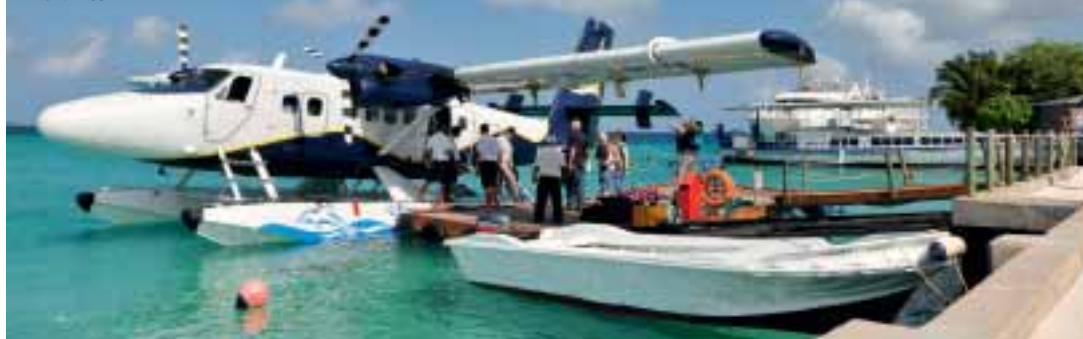
Seaplanes give you a great view of the Maldives

The Maldives is undoubtedly one of the best locations to see manta rays, but it also has some beautiful reefs, a plethora of fish