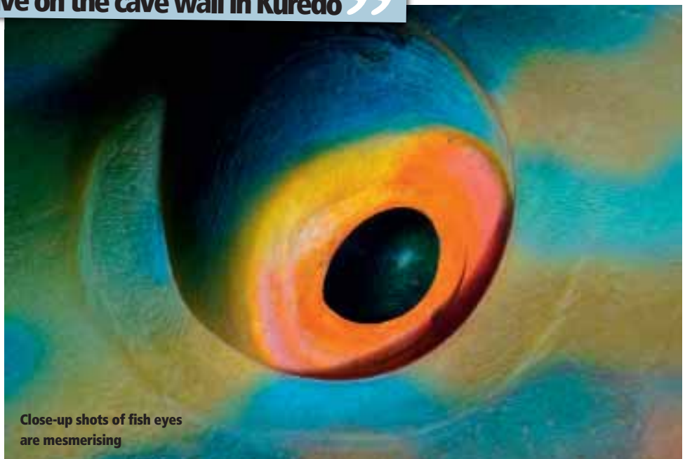
Close-up shots of fish eyes are mesmerising

Baa, Raa and Noonu Atolls are infrequently visited by most Maldivian liveboards, which means we had a unique opportunity to explore some of the finest reefs with no other liveboards on the horizon. Stretching northwest from Lhaviyani